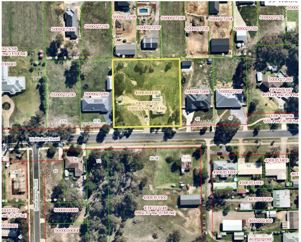
Figure 1. 39 Wattletree Road, Bunyip

The subject land is located on the northern side of Wattletree Road approximately 221 metres east of Hope Street. The land is almost square with a frontage of 63.14 metres, depth of 63.67 metres and an overall site area of 4,001m 2 .