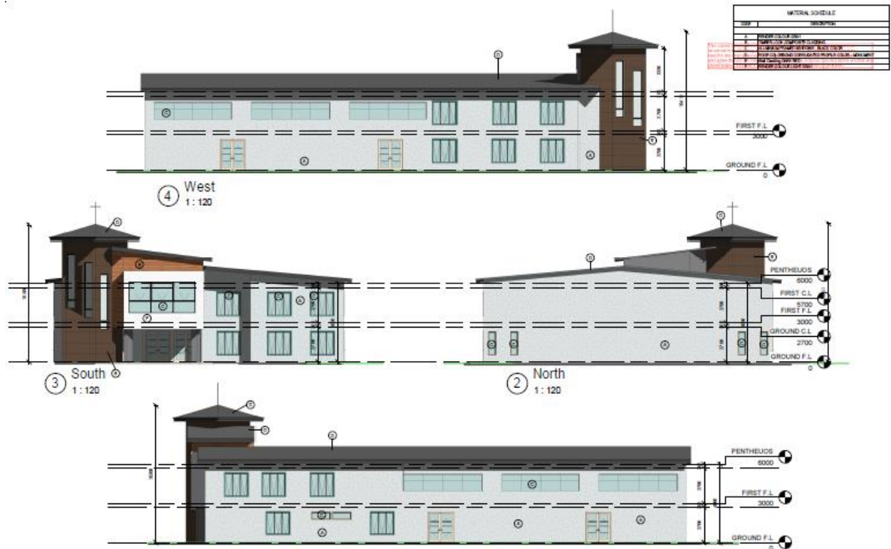
Figure 5 - Elevation Plans (noting elevation labels are incorrect).