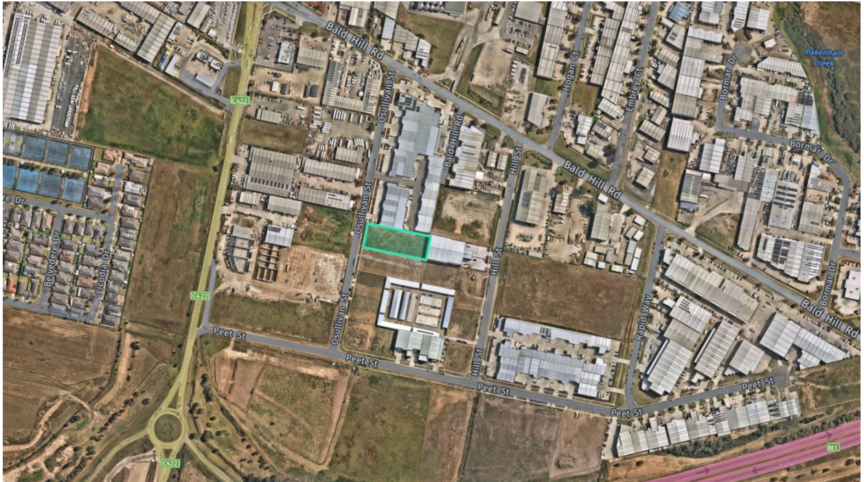
Figure 2 - Subject site and wider surrounds