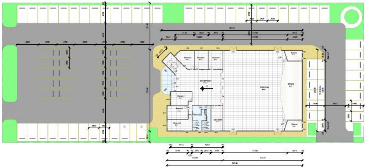
Figure 3 - Ground Floor Site Plan

The existing crossover is to be modified to result in two access points, with a proposed 74 car parks to be provided (46 to the front of the building, 28 to the side and rear) inclusive of two access points. Landscaping pockets are provided along property boundaries.