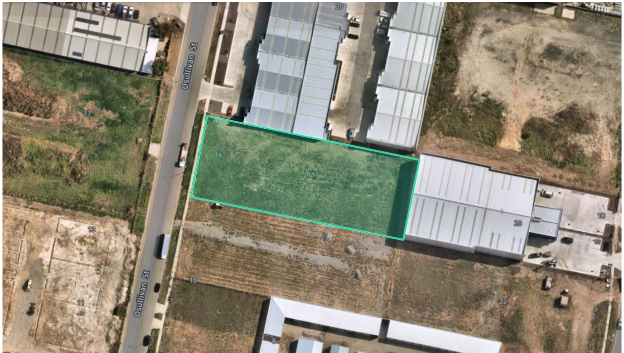
Figure 1 - Subject Site

Dominant built form characteristics reflect a typical industrial and warehousing precinct, including large 'boxy' built form to allow ease-of-use and access for large vehicles and transferrable business opportunities. Built form generally extends through the site, with small landscaping buffers at the street front, with car parking opportunities to the front, side and rear.