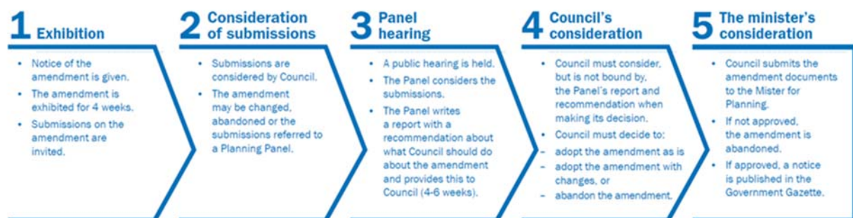
Figure 2, Steps in the Planning Scheme Amendment Process

If Council resolve to seek authorisation to prepare the Amendment, officers will prepare the required documents and submit these to the Minister for Planning. Once authorisation is received, the Amendment will be placed on public exhibition which is Stage 1 of the amendment process outlined in Figure 2 below.