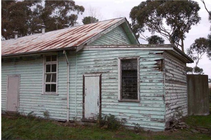
Figure 2 added rear skillion could be replaced or removed, given poor repair

I believe it should be added to the Cardinia Heritage Register and maintained in good condition as an acknowledgement of that role."