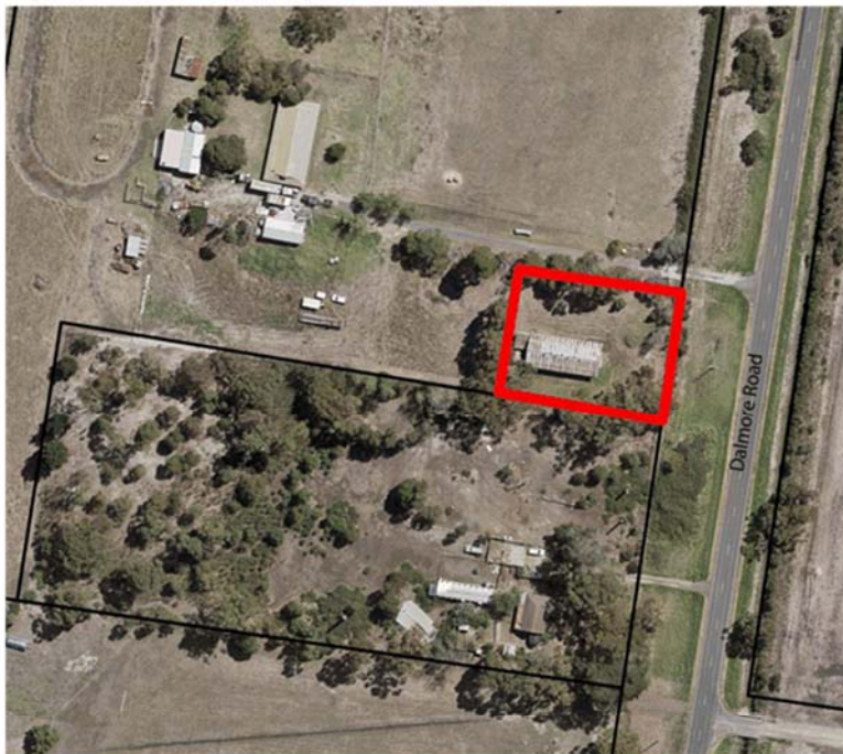
Figure 1. Land affected by the Amendment

The Amendment applies to the land at 231 Dalmore Hall Road, Dalmore as identified by the red line in Figure 1.