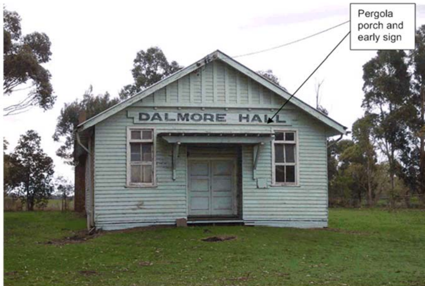
Figure 1 view from road

Graeme Butler & Associates, 2004: 1 Printed 25-05-04