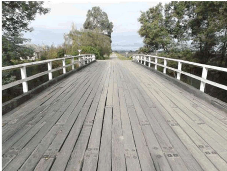
Looking south along Little Rd bridge