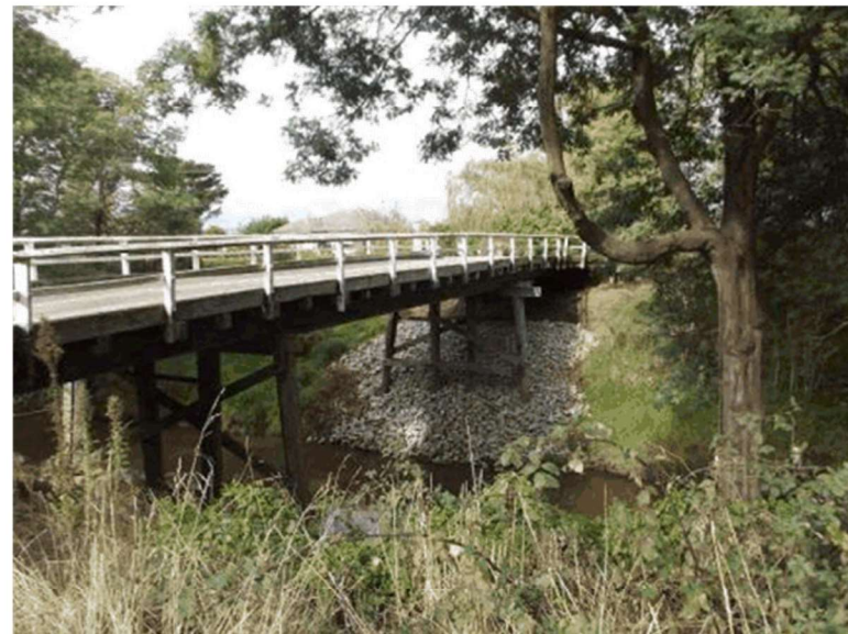
Looking at west side of Little Rd bridge